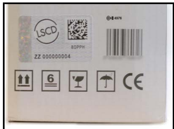
Figure 2: Application of the Serial Number Label on a Product Carton

Registered Manufacturer may use the serial number, which is shown on the Serial Number Label, as the serial number of the product and may place additional stickers with this serial number on the product and/or the Master Carton. On such additional sticker exclusively black text on a white background may be applied by Registered Manufacturer and such sticker may not look the same like the Serial Number Label sticker.